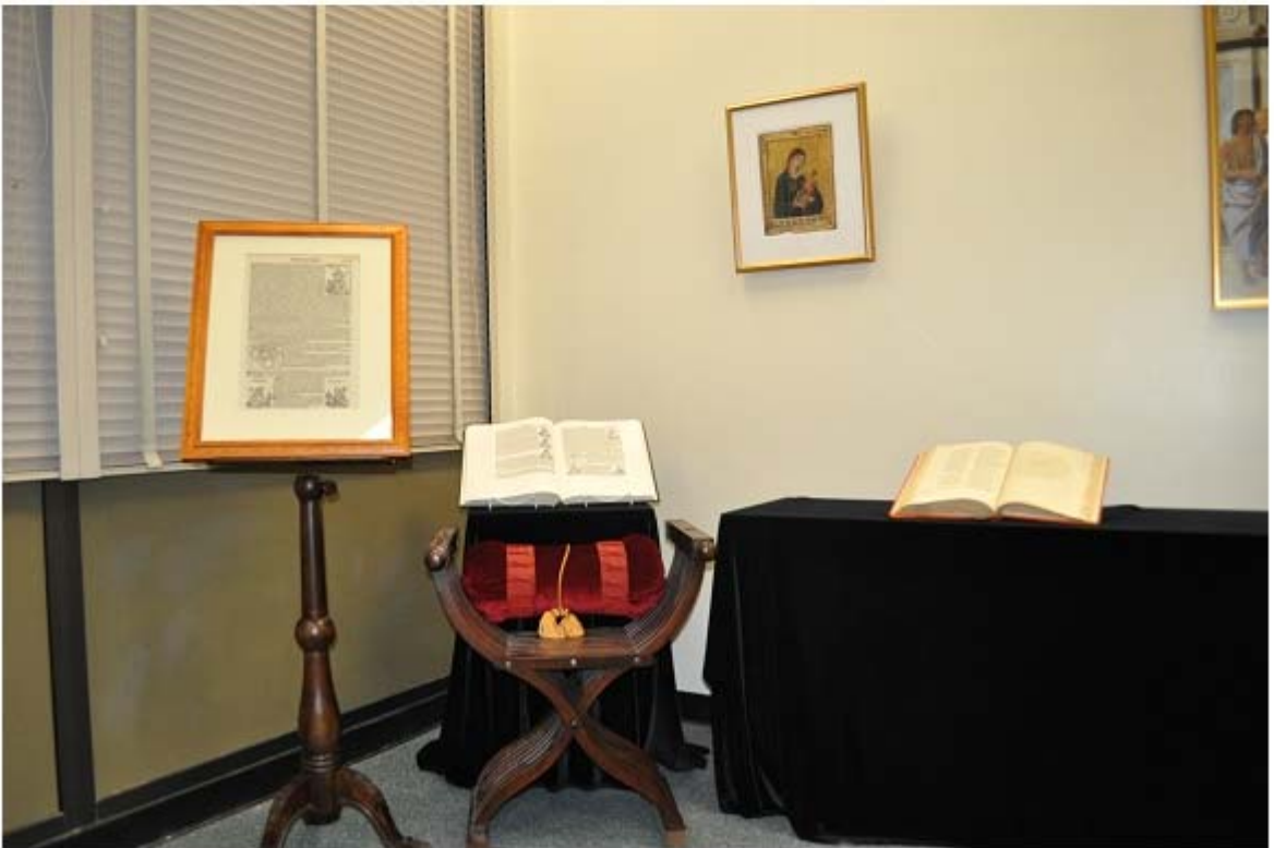
EARLY RENAISSANCE WALLS with books illustrated by Durer and Botticelli