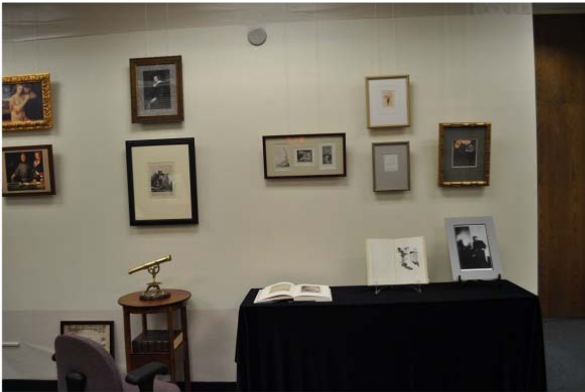
BAROQUE & 19TH CENTURY WALL with books by Blake and Manet