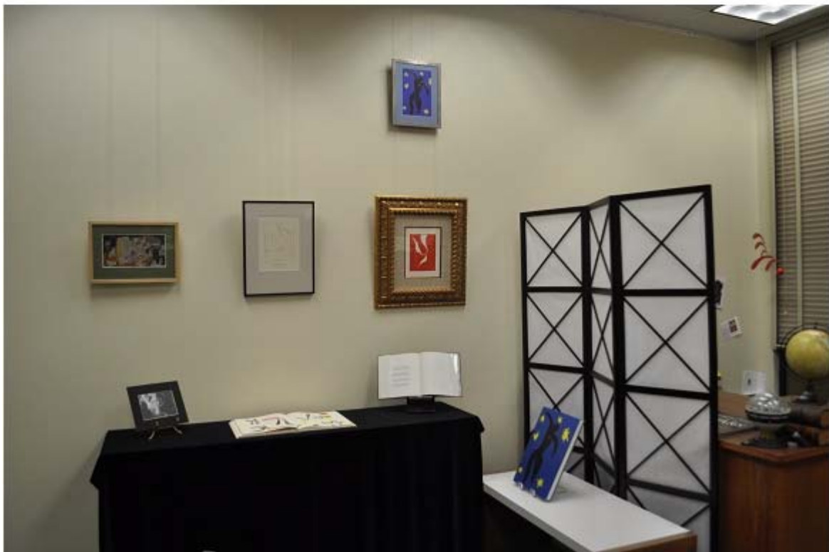
EARLY 20TH CENTURY WALL with books by Matisse and Miro